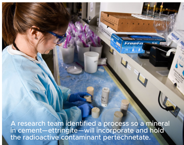
A research team identified a process so a mineral in cement—ettringite—will incorporate and hold the radioactive contaminant pertechnetate.