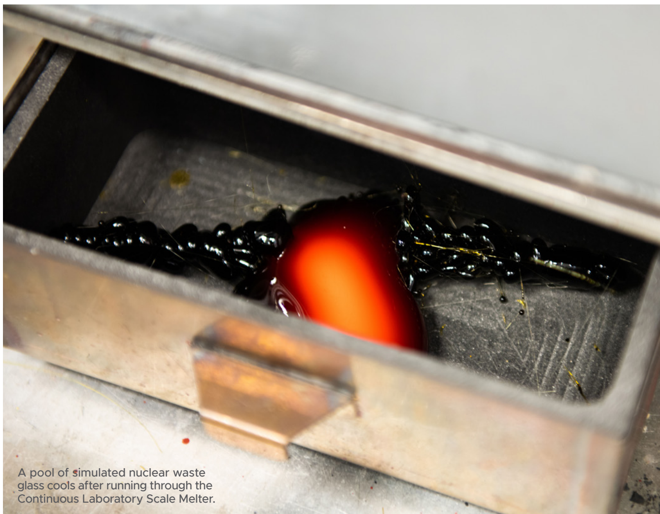
A pool of simulated nuclear waste glass cools after running through the Continuous Laboratory Scale Melter.