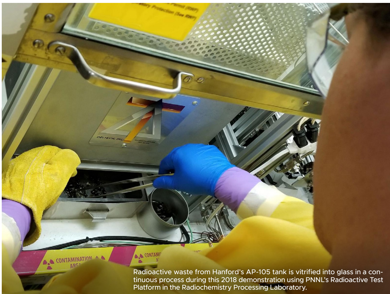
Radioactive waste from Hanford's AP-105 tank is vitrified into glass in a continuous process during this 2018 demonstration using PNNL's Radioactive Test Platform in the Radiochemistry Processing Laboratory.