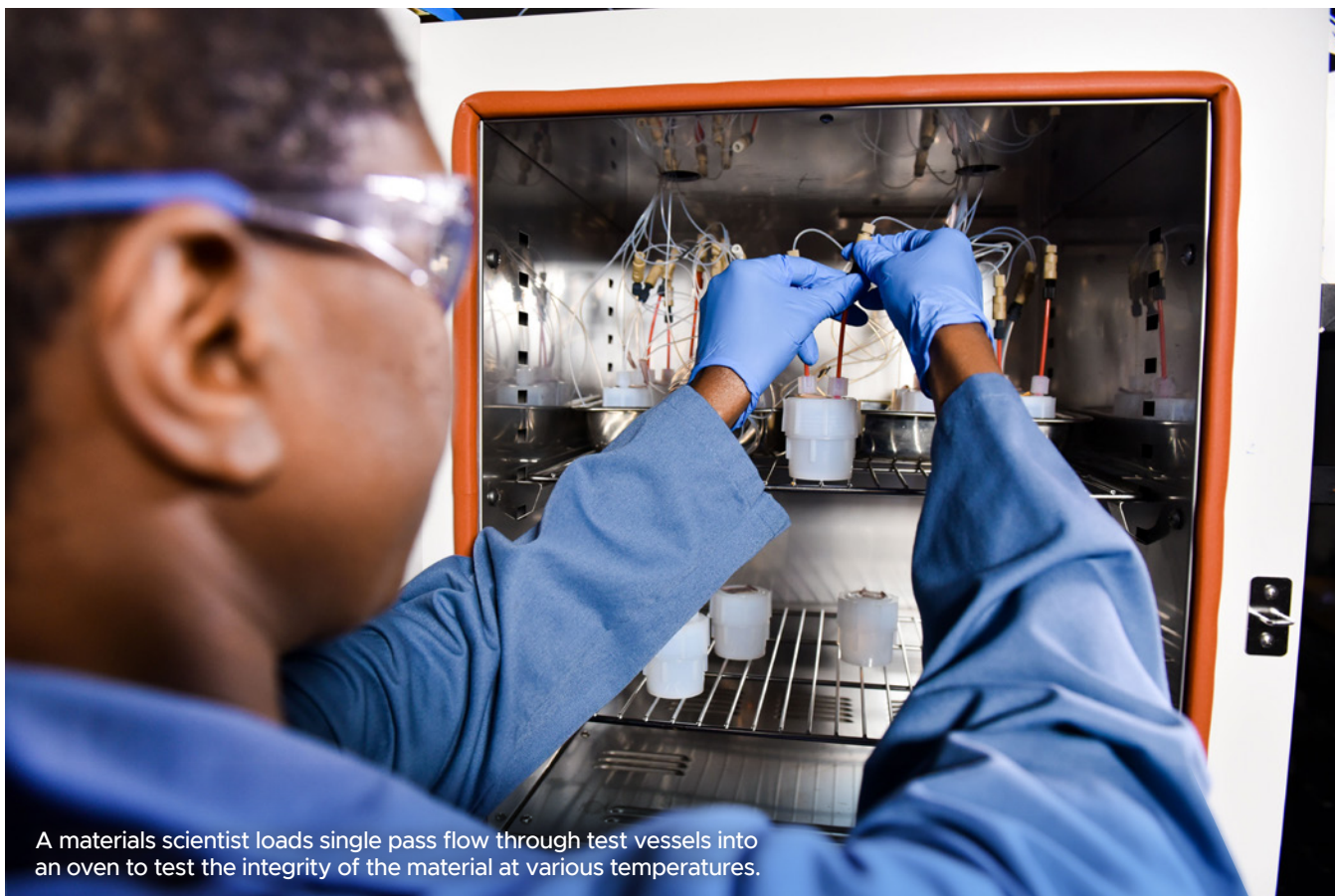
A materials scientist loads single pass flow through test vessels into an oven to test the integrity of the material at various temperatures.